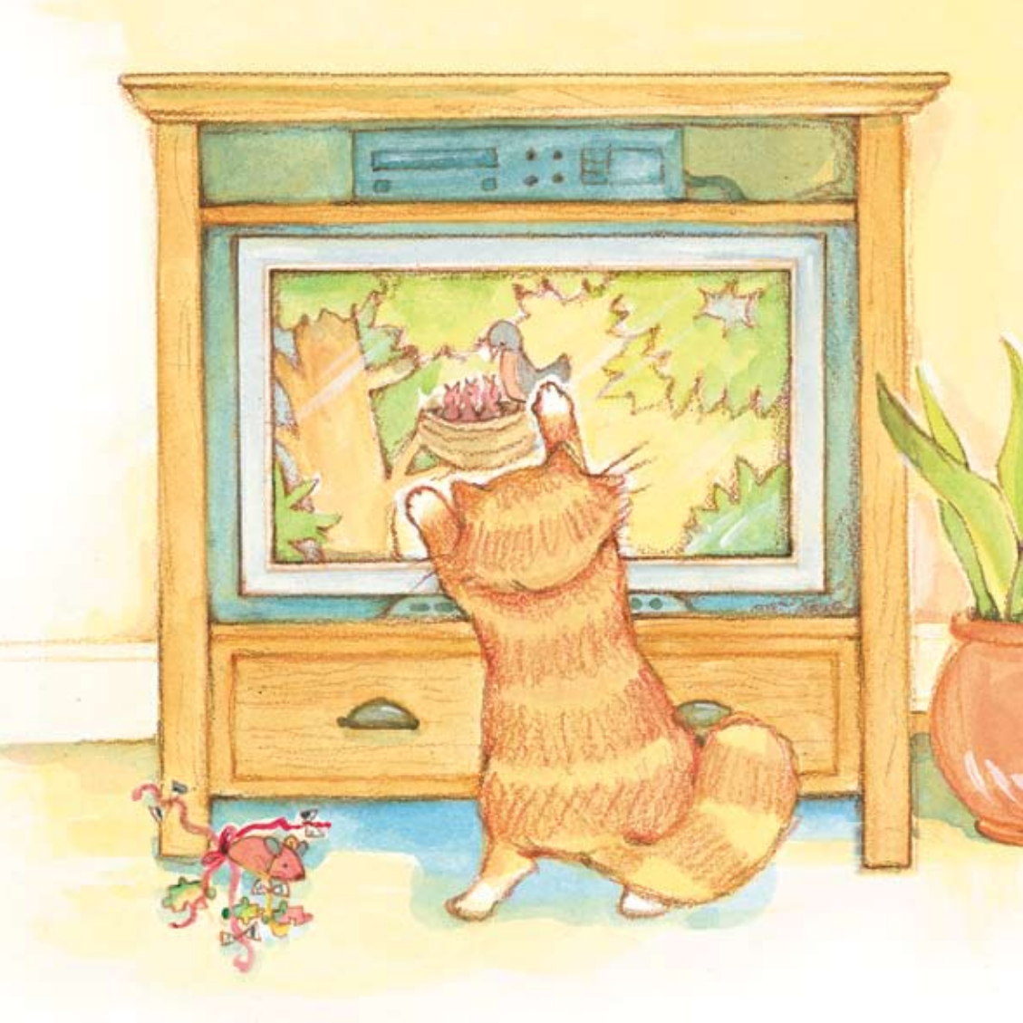
Hugs wanted to watch the television!